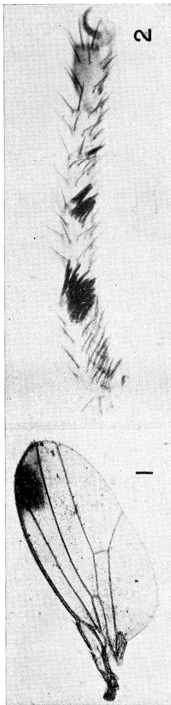
Drosophila (s.) sahyadri sp. n. Figures 1 and 2. 1. Wing of male showing black patch. 2. Fore leg of male showing sex-combs.